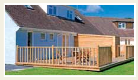
PREMIER 3 BEDROOM COTTAGE