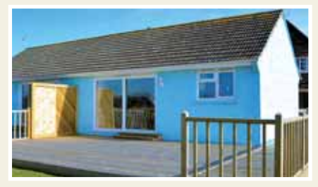
PREMIER 2 BEDROOM COTTAGE